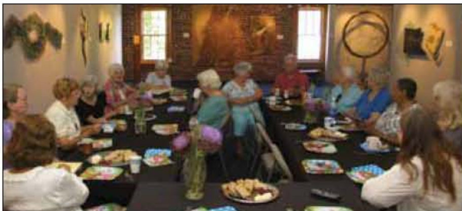
Museum volunteers at their monthly get-together