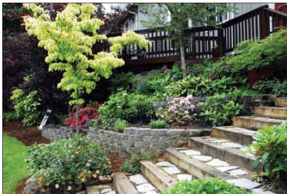
Art In The Garden