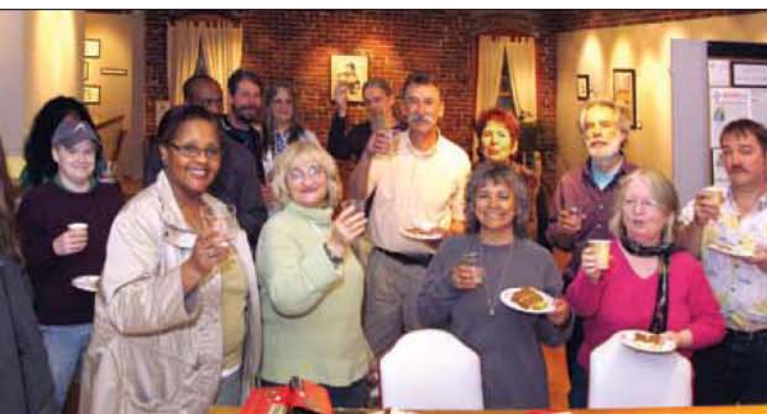
Poetry at the Museum - 1 year Anniversary