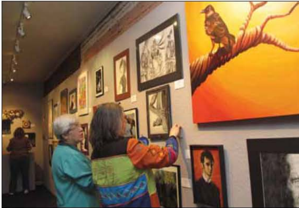
Exhibition: Best of the Best - Area High School Artists