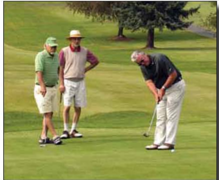
Golf For Art