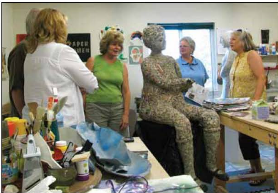
Artist's Studio Tour