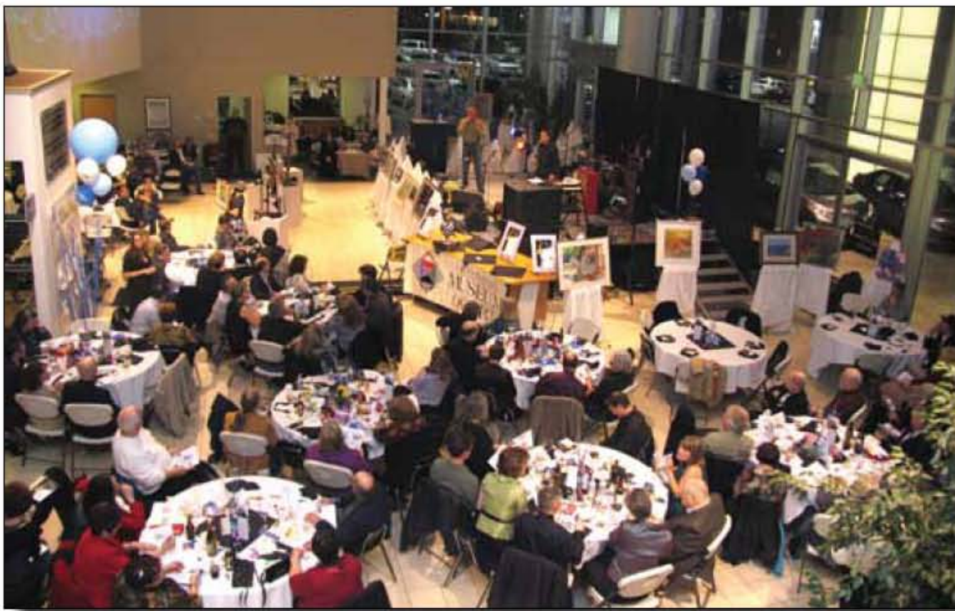
Black, White & the Blues