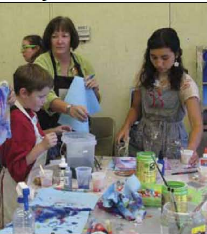
Kids Summer Workshops